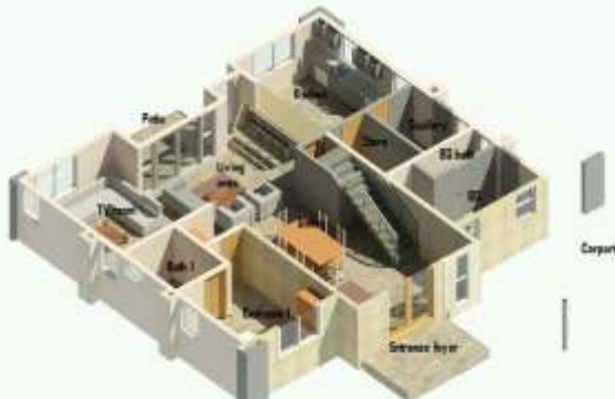
Typical Ground Floor Plan